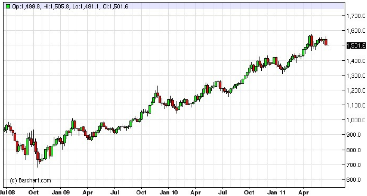
GC - Gold (COMEX) - Weekly Continuation Candlestick Chart

Investors from around the world benefit from timely market analysis on gold and silver and portfolio recommendations contained in The Gold Speculator investment newsletter, which is based on the principles of free markets, private property, sound money and Austrian School economics.